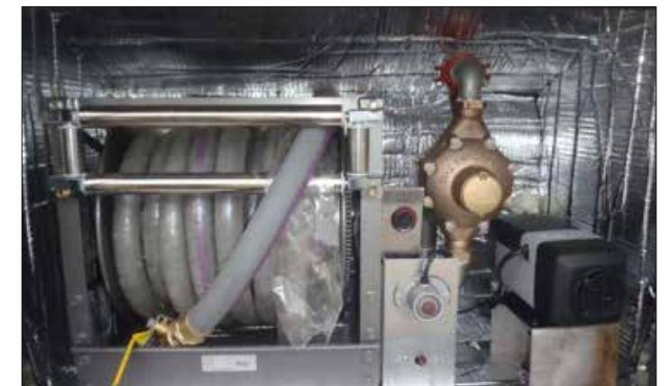
Heated and insulated cabinet with food grade metering and dispensing system