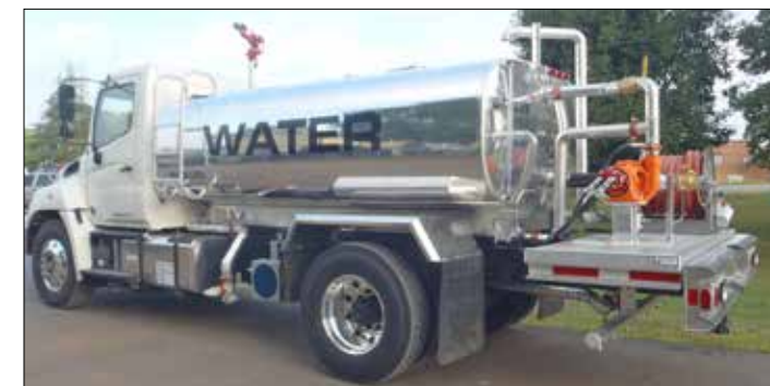
Aluminum non-potable water tank with a top mounted spray cannon, side mounted spray heads, rear spray bar, and rear platform