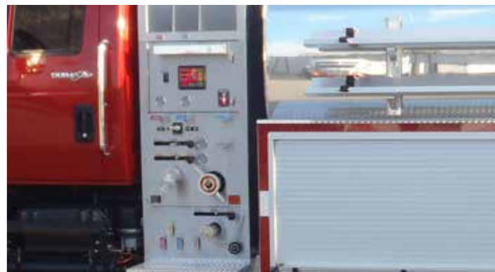
Pump module mounted behind cab with top hose storage