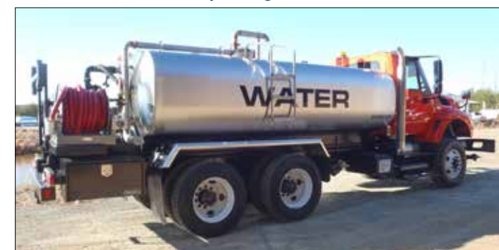
Stainless steel non-potable water tanker with hose reel and pump on a raised platform with rear LED directional traffic advisory bar sign and front and side mounted spray heads