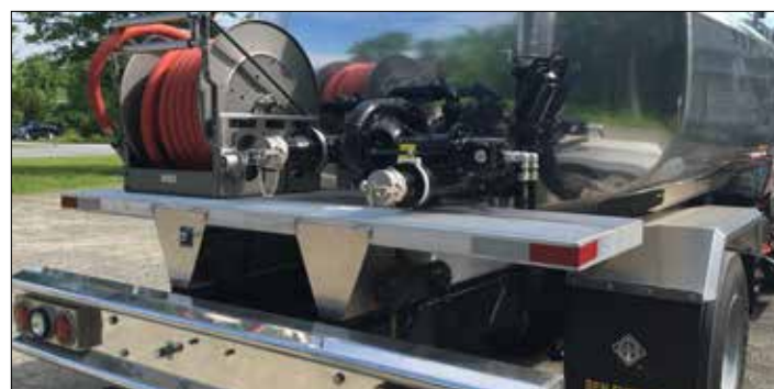
Rear aluminum extruded platform platform to house dispensing equipment and a curbside rear hydrant fill