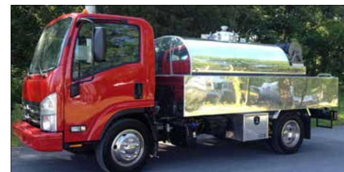
Aluminum Non-Potable water tank with a surrounding enclosure and a rear dispensing area