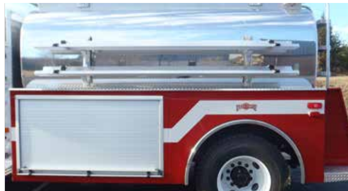
Full side skirting with built in cabinets with roll-up door