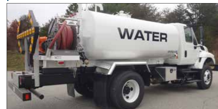
Steel non-potable water tanker with hose reel and pump on a raised platform with rear LED directional traffic advisory bar sign