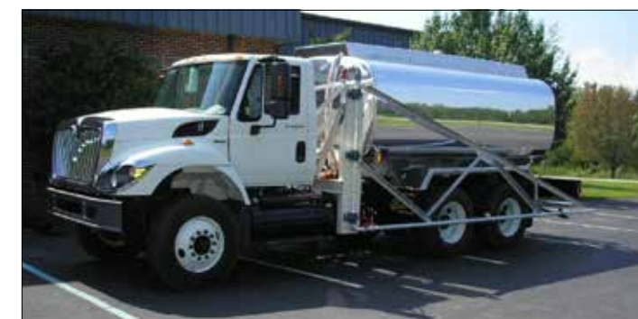
Aluminum Non-Potable water tanker with a driver side swing arm with built in spray heads