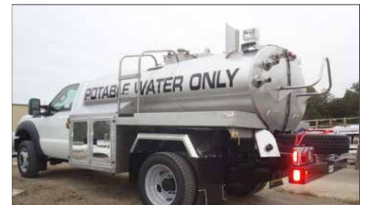
1,200 gallon stainless steel potable water truck with side delivery cabinets