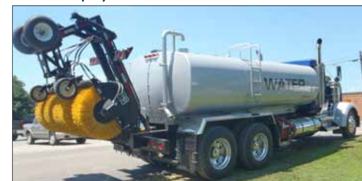
Steel Non-Potable water tanker with a rear sweeper