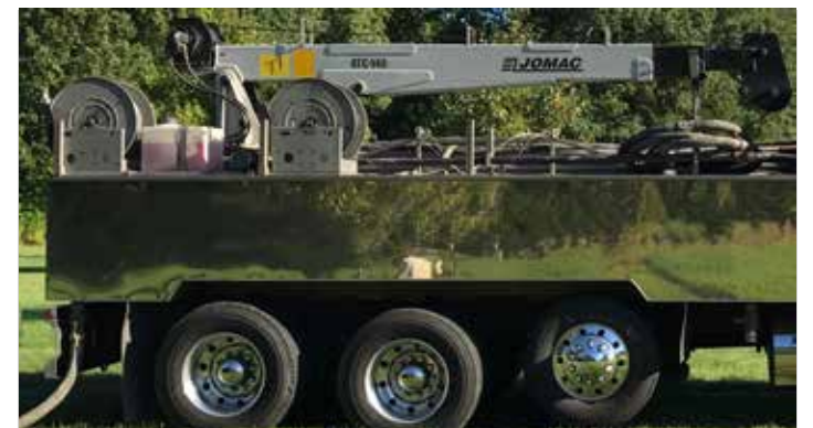
Several different types of crane makes and models available with various lifting capacities