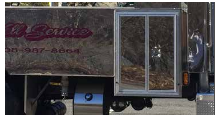
Body mounted vertical or horizontal storage compartments