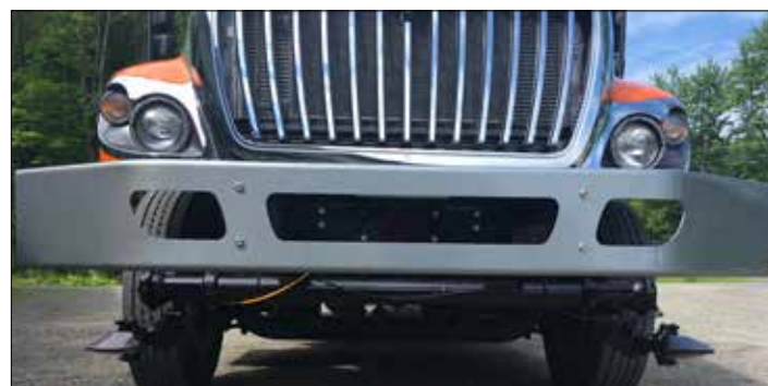
A pair of front mounted dual spray heads underneath the front bumper