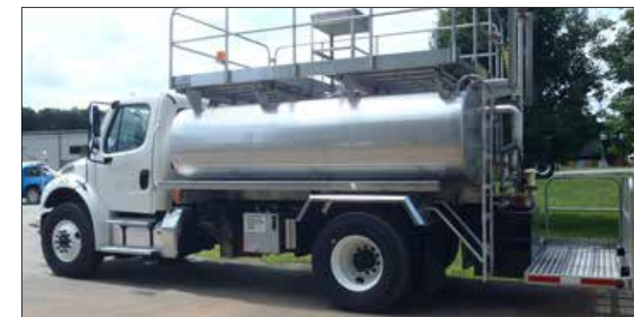
Stainless Steel Non-Potable water tanker with a rear step platform and a top adjustable work area with a vertical and horizontal spray bar to clean out tunnels