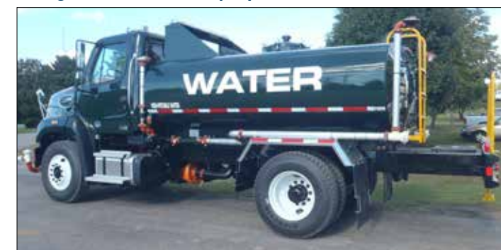
Steel non-potable water tank with raised spray heads and rear platform